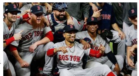
The Red Sox celebrating their 9th World Series

The World Series ended in the 5 th game on October 28 th . Although the Dodgers were impressive in each game, especially the third, the Red Sox ultimately won the series. The first year manager, Alex Cora had led them to victory. Red Sox players Mookie Betts, Jackie Bradley Jr. and Ian Kinsler won the Gold Glove Award this year as well. In conclusion, the World Series was amazing to watch, broke many records, and the Red Sox were crowned champions.