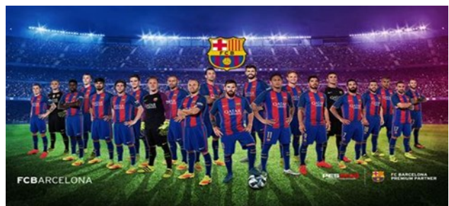
Barcelona 2018 team