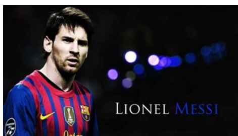
Lionel Messi in his Barcelona jersey

Lionel Messi stands number one out of the top ten players in the world. Lionel Messi made 371 goals in his career so far. That is a lot of goals for one player! And get this: Lionel Messi is on the Barcelona team ranked number one in the world right now. It's really cool that Lionel Messi is the best player in the world and he is on the best team in the world. Additionally, Barcelona has won 14 trophies in the last 4 years. They really worked hard on getting those trophies. I encourage sports fans and non-sports fans to watch Lionel Messi and Barcelona the best soccer player and soccer team in the world!