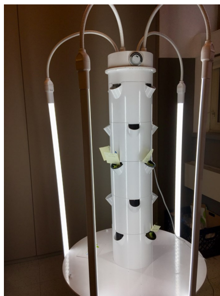
A photo of Memorial's own "alien-like" system